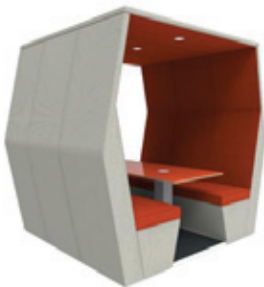
Bill - 6 seat Den