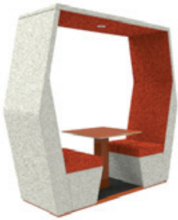
Bill - 2 seat Den