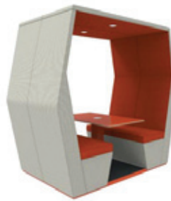
Bill - 4 seat Den