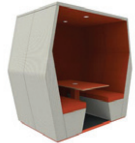
Bill - 4 seat Den with wall