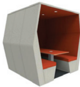
Bill - 6 seat Den with wall